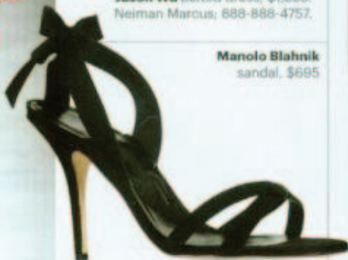
Manolo Blahnik sandal, $695