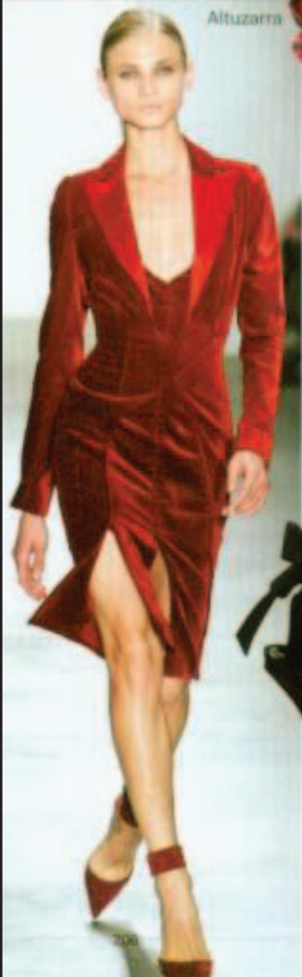
Marisa Berenson Altuzarra