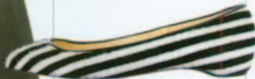
Christian Louboutin flat, $775