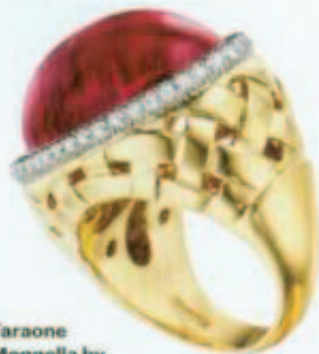
Faraone Mennella by R.F.M.A.S. ring