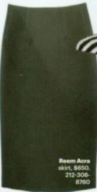
Reem Acra skirt, $650. 212-306-8760